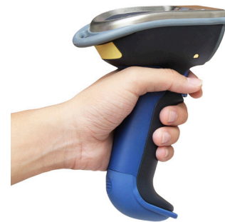
Optional Handheld Barcode Scanner