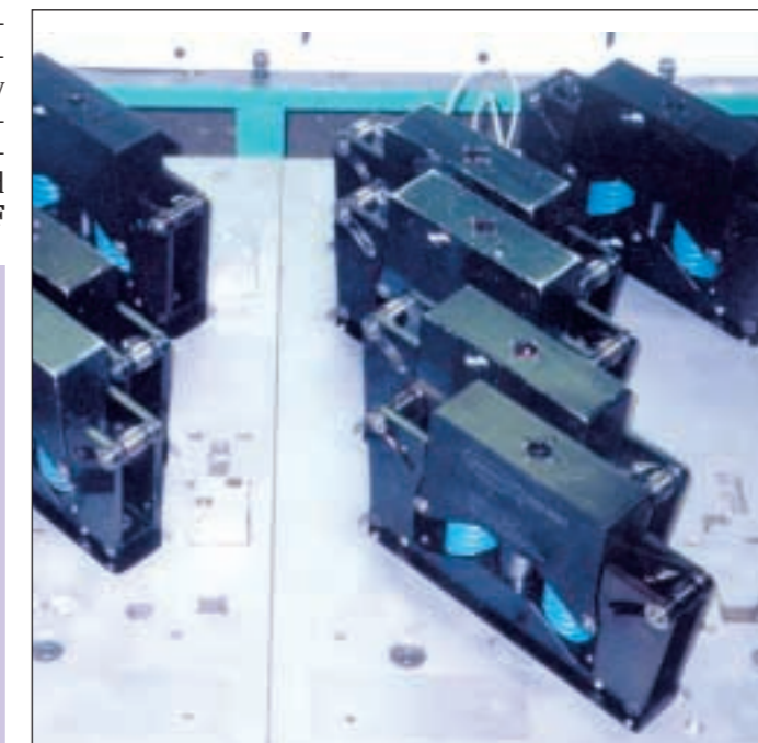
These in-die-tapping units can be removed and installed on other dies, making the technology more cost-efficient. Note the tubes in the back of the die. These supply lubrication to the tap holes during the tapping process.

Besides the units in use at Trends, other types of tapping-tool styles are available for various applications. An example is Danly's Pronic electromechanical unit, which operates independent of press power.