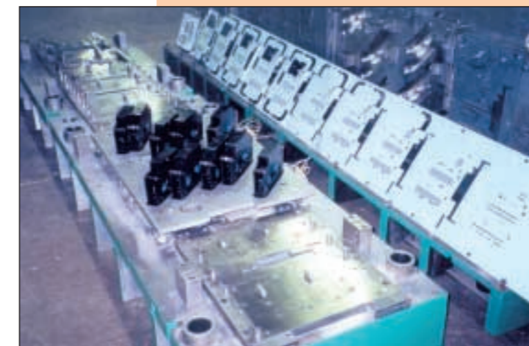
This 10-station progressive die, with the strip showing what functions are performed at what station, incorporates tapping units, the black boxes in the center of the lower die.